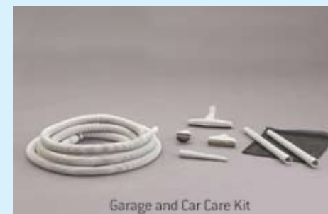
Garage and Car Care Kit