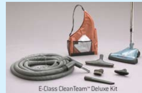
E-Class CleanTeam™ Deluxe Kit